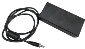
▲ AC power adapter (for GOT110--316-J)